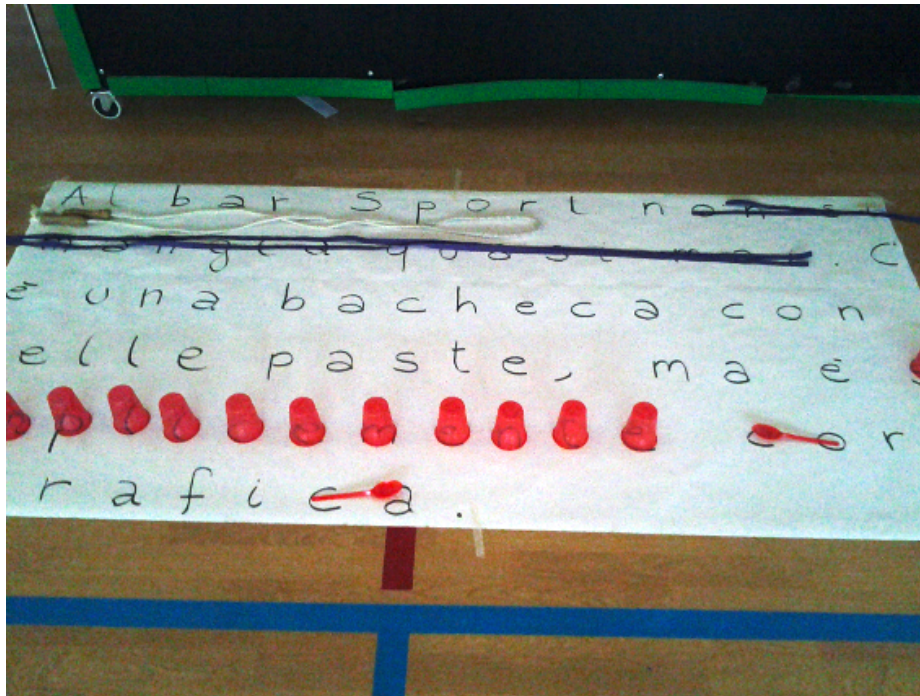
Fig. 1. Reproducing meta-information with objects

Guardando il colore della sua crema i vecchi riuscivano a trarre le previsioni del tempo.